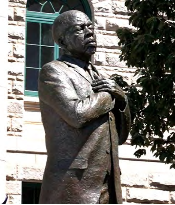
A statue of John Lewis is unveiled in Decatur, Georgia, on Saturday, August 24.

A statue honoring civil rights hero and US Congressman John Lewis was unveiled Saturday outside of Atlanta, replacing a Confederate monument that had stood there for more than a century.