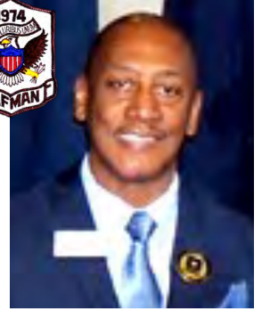
Submitted by Donald Durant