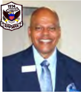
Submitted By RAFMAN Charles Dorsey