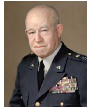
Omar Bradley: September 20, 1950