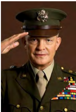
Dwight D. Eisenhower: December 20, 1944