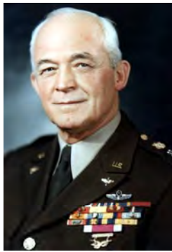
Henry H. Arnold: December 21, 1944