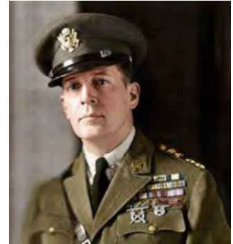
Douglas MacArthur: December 18, 1944