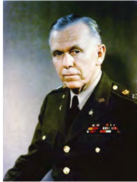
George Marshall: December 16, 1944

Five U.S. Army generals have held the rank of five-star general, beginning in 1944.