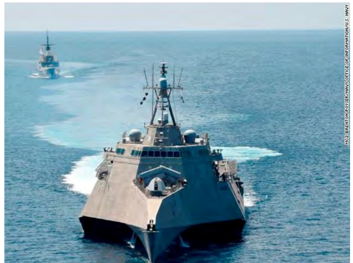
The Independence-variant littoral combat ship USS Gabrielle Giffords, front, takes part in exercises with the Singapore navy's Formidable-class multi-role stealth frigate RSS Steadfast in the South China Sea, May 25, 2020.

Littoral combat ships come in two variants, the single-hull Freedom class and the Independence class catamarans, of which Canberra is the 15th. ... Continue on page 11b.